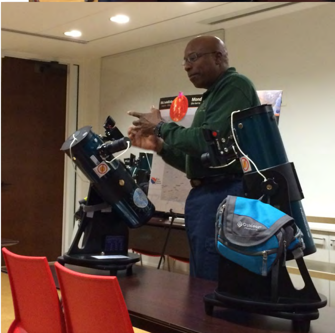
From the Central Library branch for St. Louis Public Library