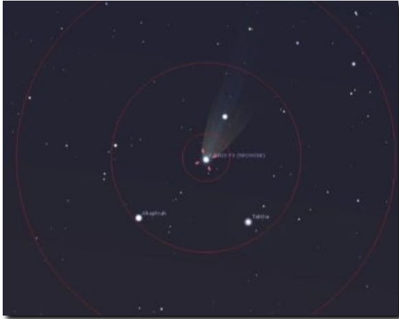
Simulated view of Comet C/2020 F3 (NEOWISE) through binoculars.

In my 24mm Panoptic eyepiece, the nucleus of the comet was big and bright, and the coma was very obvious. The tail extended beyond the field stop, filling my entire field of view with comet awesomeness.