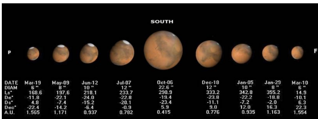
Changing size of Mars over a 1 year span centered on the Oct 3 rd opposition.

I went into it thinking it was maybe an intermediate level program and came out of it dazed and amazed because it's very close to, if not an advanced level program. I say Dazed because it demands that you drink from a firehose of knowledge so to speak. This knowledge pertains to various Albedo features, weather features, orbital & rotational characteristics and their effects on when you'll be able to observe said features and when you can't. Other demands of the program include estimating Polar cap size and location, as well as observing every longitude of the face of Mars ... twice.