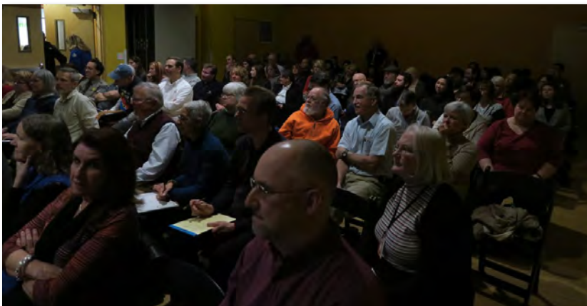
Above: Crowd at the January Eclipse Task Force meeting.