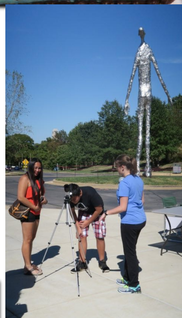
Left: "Looking Up", a new sculpture at the Planetarium Above and Right: Solar viewing on Astronomy Day